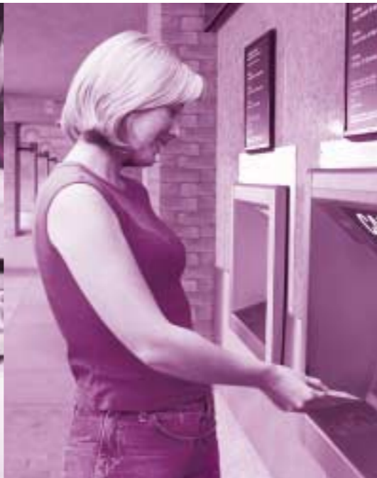
> Finding the nearest bank...

With in excess of 90,000 places of interest available, visiting that restaurant in the middle of nowhere your friend recommended couldn't be easier, or stopping off for a bite to eat in unfamiliar surroundings becomes simple and stress-free.