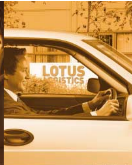
➤ Press the Smartnav button and... ➤ tell the PA your destination...