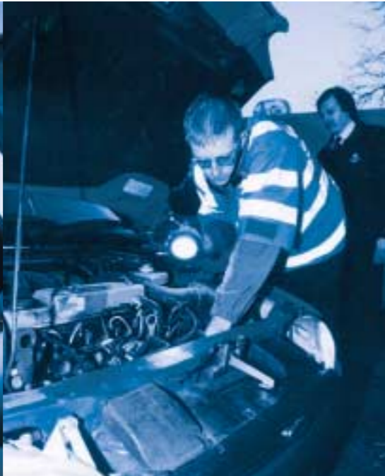
> Broken down...

In unfamiliar surroundings, a Smartnav PA can provide help and reassurance 24 hours a day, 7 days a week.