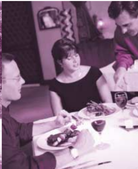
> Work, rest and play!

In addition to UK residential and business address listings, thousands of other useful or remote destinations, including petrol stations, shops and hotels, are at the PA's fingertips.