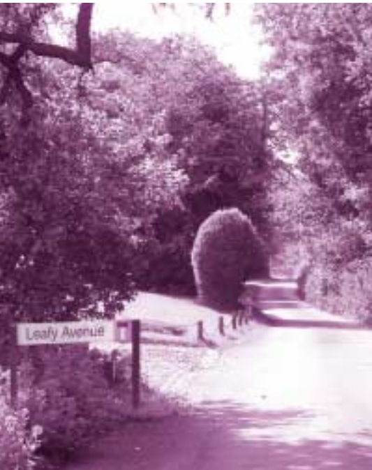
> Find any location

Smartnav combines the very best in navigation technology with the personal touch. Simply press the Smartnav button and you will be connected to one of a team of PAs, trained to locate your destination and assist with a wide range of motoring needs, 24 hours a day, 7 days a week. Unlike conventional systems, which require a complicated destination entry process, the Smartnav system couldn't be simpler. It doesn't even matter if you don't have the exact details of your destination. Using part of an address, or just the postcode, the Smartnav PA has access to a comprehensive, up-to-date database, which gives them the complete address.