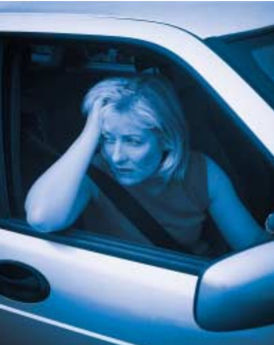
> Alone and stranded...

In the event of a breakdown or emergency, it can be frightening to find yourself stranded, particularly if it's late at night and you're on your own. As soon as you press the Smartnav button, a PA can automatically pinpoint your exact location and call for assistance. Your location details will be sent directly to the appropriate breakdown or emergency service, so you can feel reassured that help is on its way.